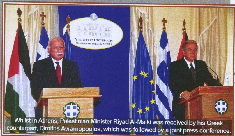
Whilst in Athens, Palestinian Minister Riyad Al-Malki was received by his Greek counterpart, Dimitris Avramopoulos, which was followed by a joint press conference.