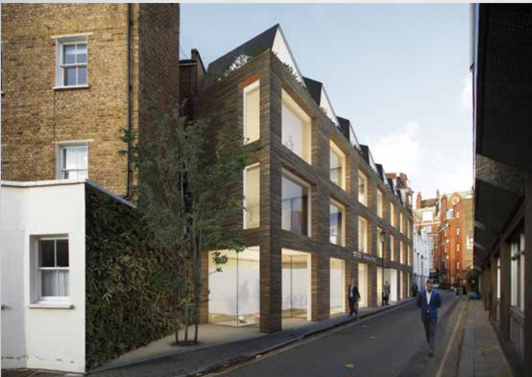
BB Energy Houses in London and Beirut

Q We would like to know the secret of maintaining the continuity of your family-based business for over three generations, considering the difficulties involved and consequent and frequent examples of disintegration of many such family enterprises during the second or third generations.