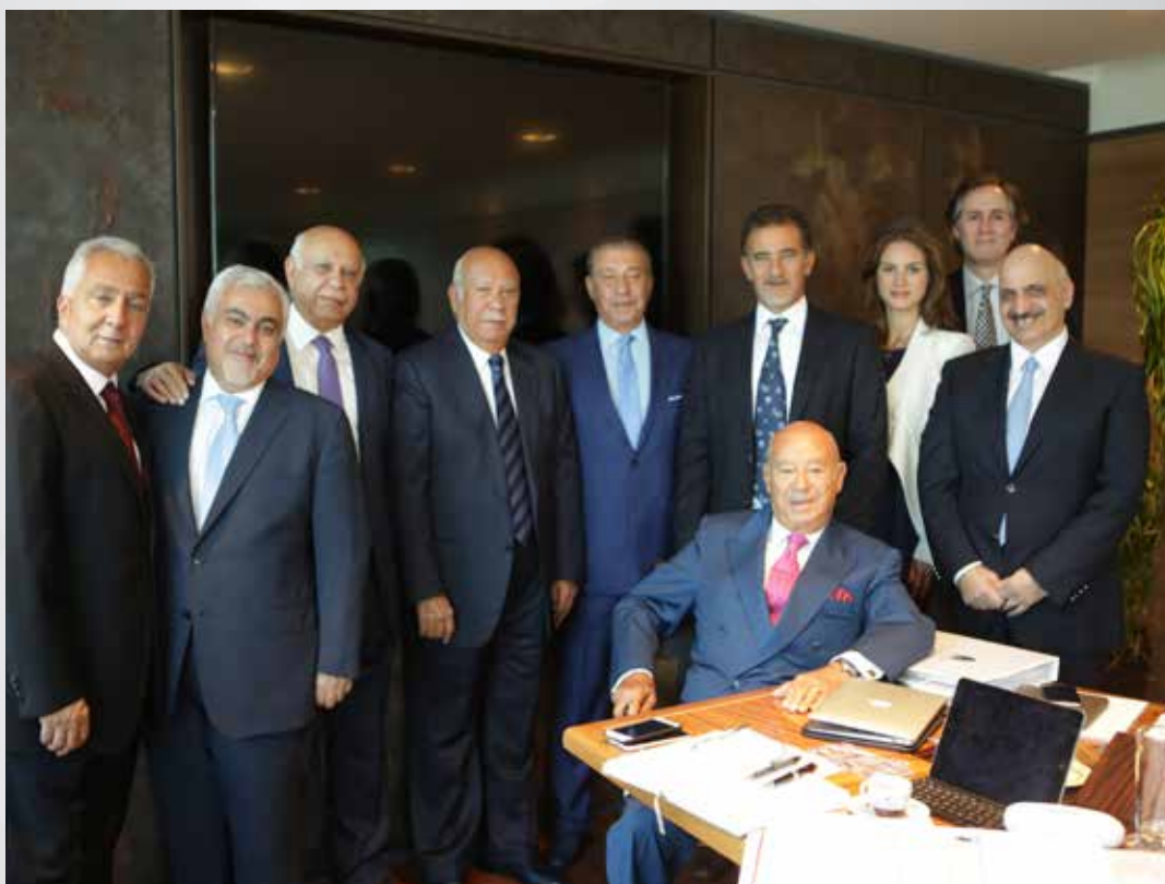
BB Energy Board members

A I am by nature very family oriented and we are a very big family. I think we have been successful in grooming the next generations to come in not just their areas of expertise but also in the family ethos; that is ‘our word is our bond’, honesty, hard work and a very open channel of communications throughout the family.