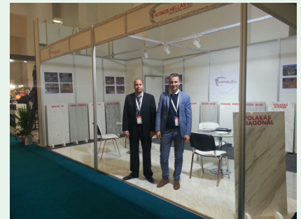
MARBLE 2015 IZMIR TURKEY STAND 206 HALL B 25-28 MARCH

Our clients had the opportunity to see the Greek marbles we can provide them from our privately owned quarries: Golden Spider (exclusivity), Nestos ( exclusivity), Thassos, Volakas and also other Greek marbles such as: Silver Grey, Alivery Grey, Levadia Black, Pentelikon, Tinos Green, White Sivec, Lygourio Beige, Santa Elena, Lydia Beige etc