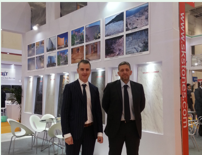
XIAMEN STONE FAIR CHINA Q028 HALL Q 6-9 MARCH