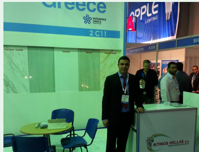
BIG 5 JEDDAH SAUDI ARABIA STAND 2 C 11 HALL 2 9-12 MARCH