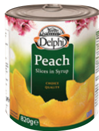
peach slices in 1kg tin