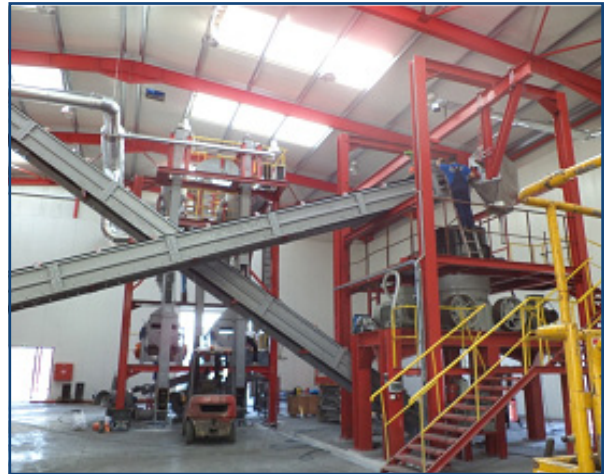
BRAND NEW AND SHINING BUILDING AND MACHINERY

Rubber granules are sold to manufacturers around the world for use in road asphalt, athletic turf fields, and playground surfaces.