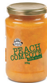
peach compote in 360ml glass jar