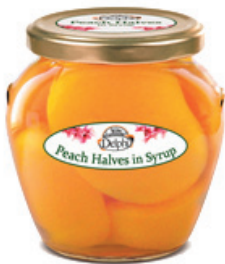
peach halves in 580ml glass jar

We supply our products under our own Delphi brand or Private label.