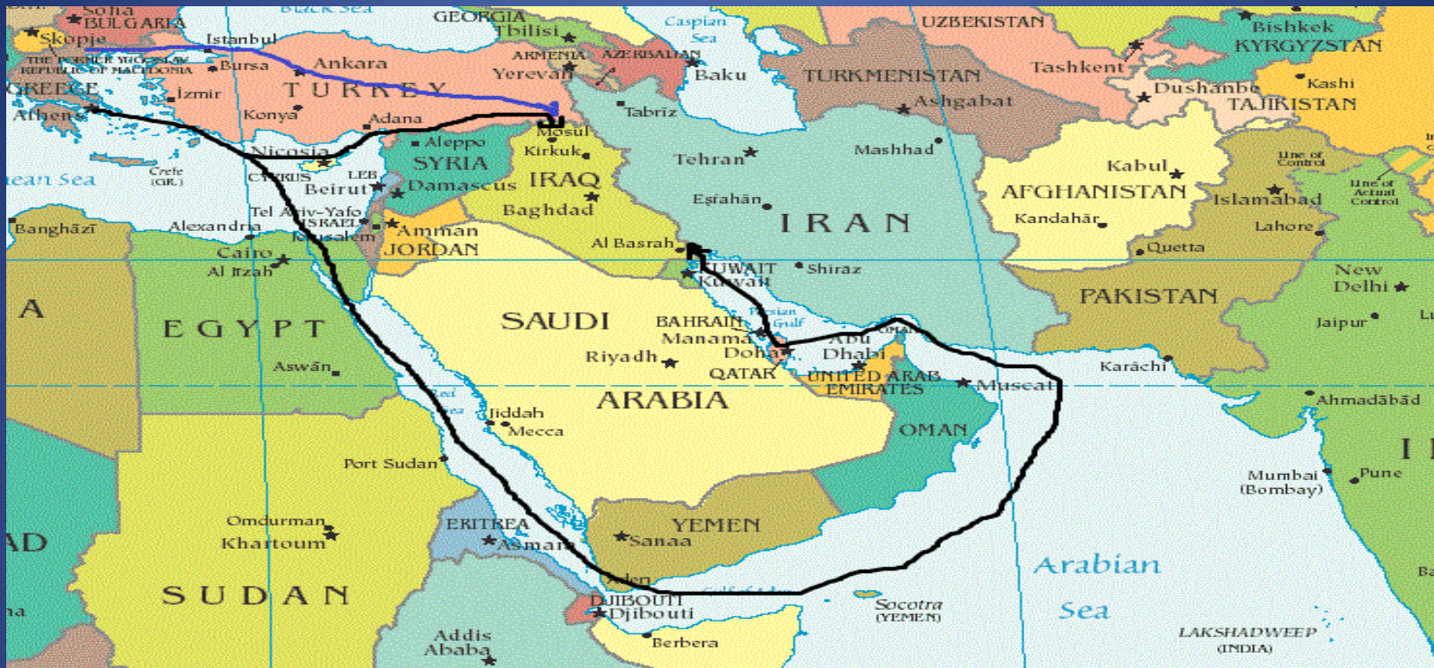
Average transportation cost with container from Greece to Iraq