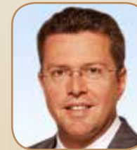
H.E. Mr. Herbert Scheibner

This Forum is a proper platform for exchanging of experience and creating business partnership. I would like to express my gratitude for being one of the participants of this Forum. Our thanks go to the Organizers for a job well done.