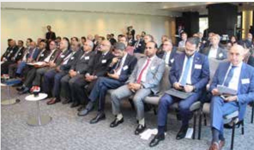
Attendees are following visual presentations

The Mayor of Antwerp hosted a dinner party for the delegates attended by high ranking officials.