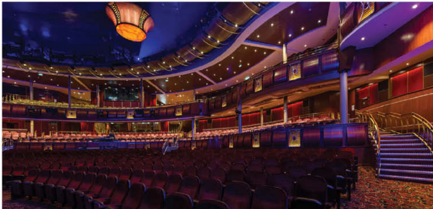
HARMONY OF THE SEAS - THEATER