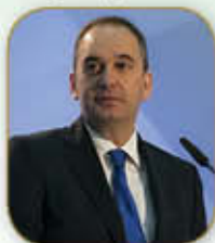
Ioannis Plakiotakis Minister of Shipping & Islands Policy, Greece