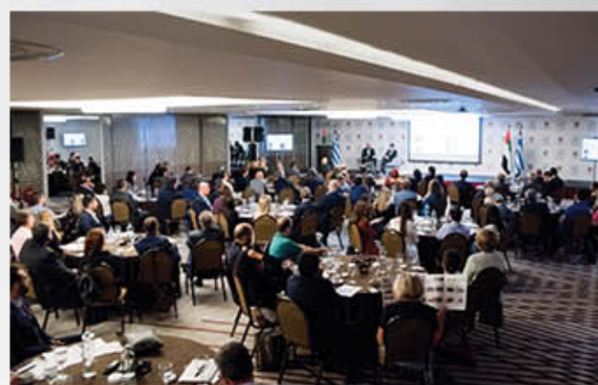
A view from the hall

providing them with Arabic books and knowledge materials to enable them to maintain their language.