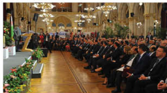
A view of the audience attending the event