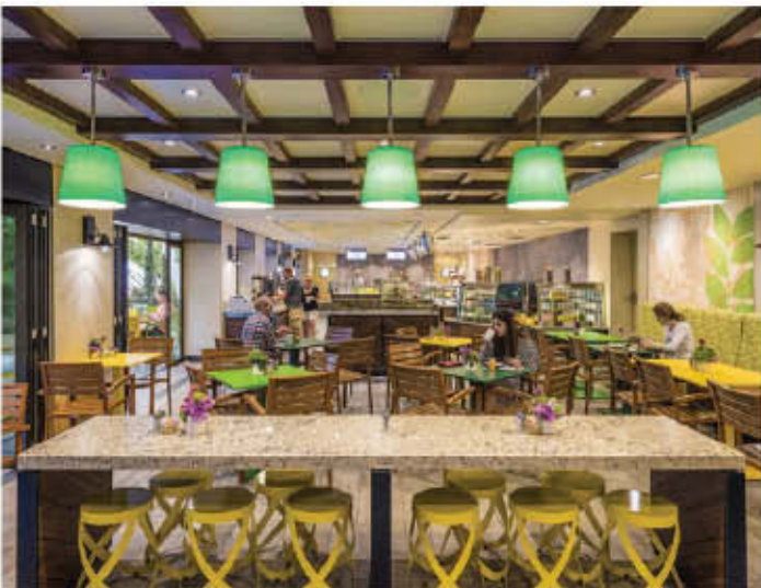
SYMPHONY OF THE SEAS - PARK CAFE