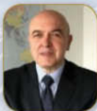
Kostas Fragogiannis Deputy Minister for Economic Diplomacy and Openness, Ministry of Foreign Affairs, Greece