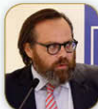
Dr. Evangelos Kyriazopoulos Secretary General, Minister of Shipping & Islands Policy, Greece