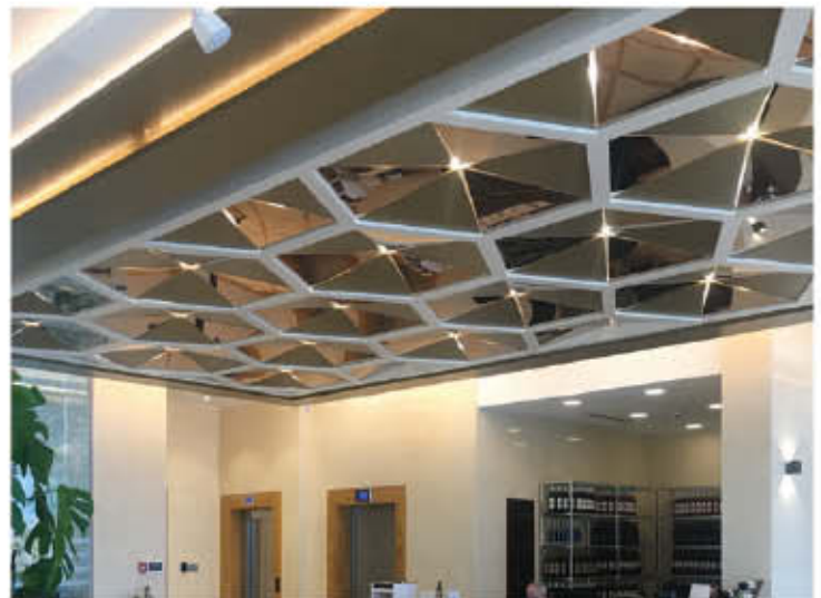
CYPRUS - WINERY RECEPTION