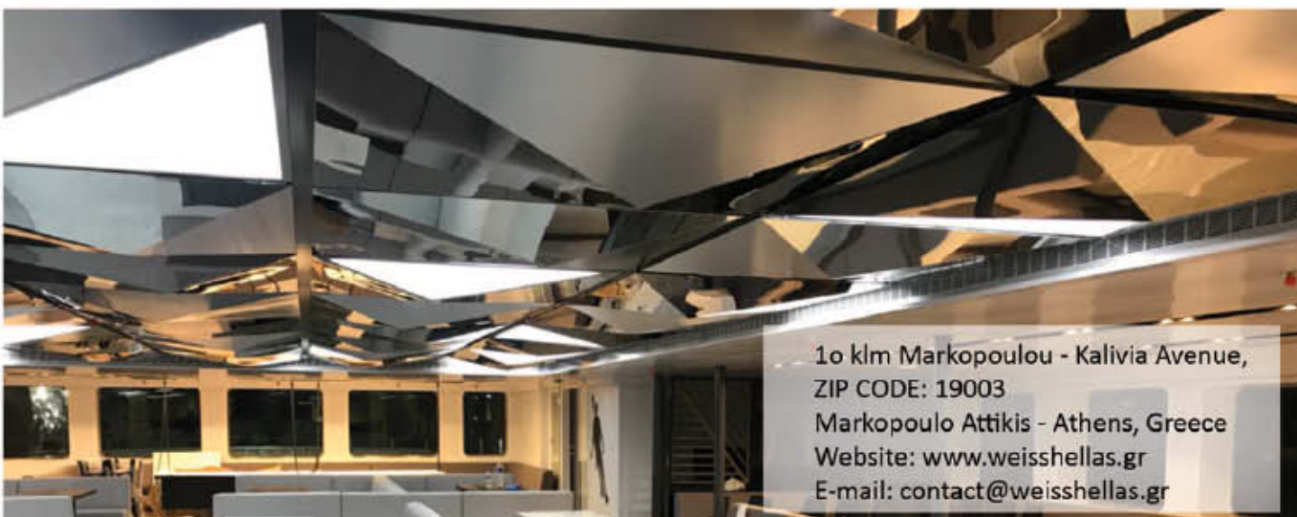
ANAX - LOUNGE

1o klm Markopoulou - Kalivia Avenue, ZIP CODE: 19003 Markopoulo Attikis - Athens, Greece Website: www.weissshellas.gr E-mail: contact@weissshellas.gr