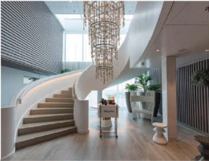
CELEBRITY EDGE - SPA