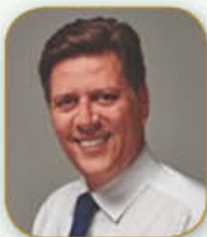
Miltiadis Varvitsiotis Alternate Minister of Foreign Affairs, Representative of the President of the Hellenic Government