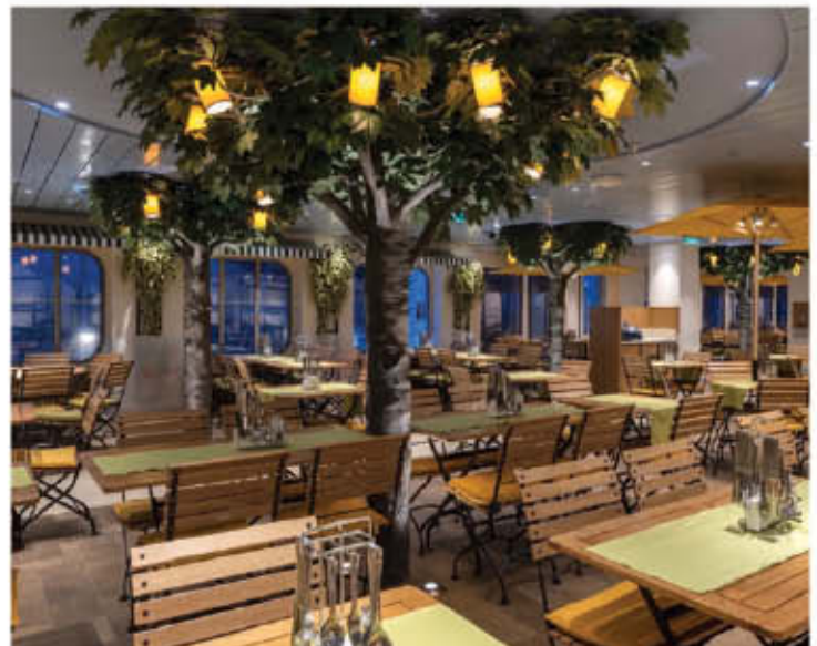
AIDA NOVA - BRAHAUS BREWERY