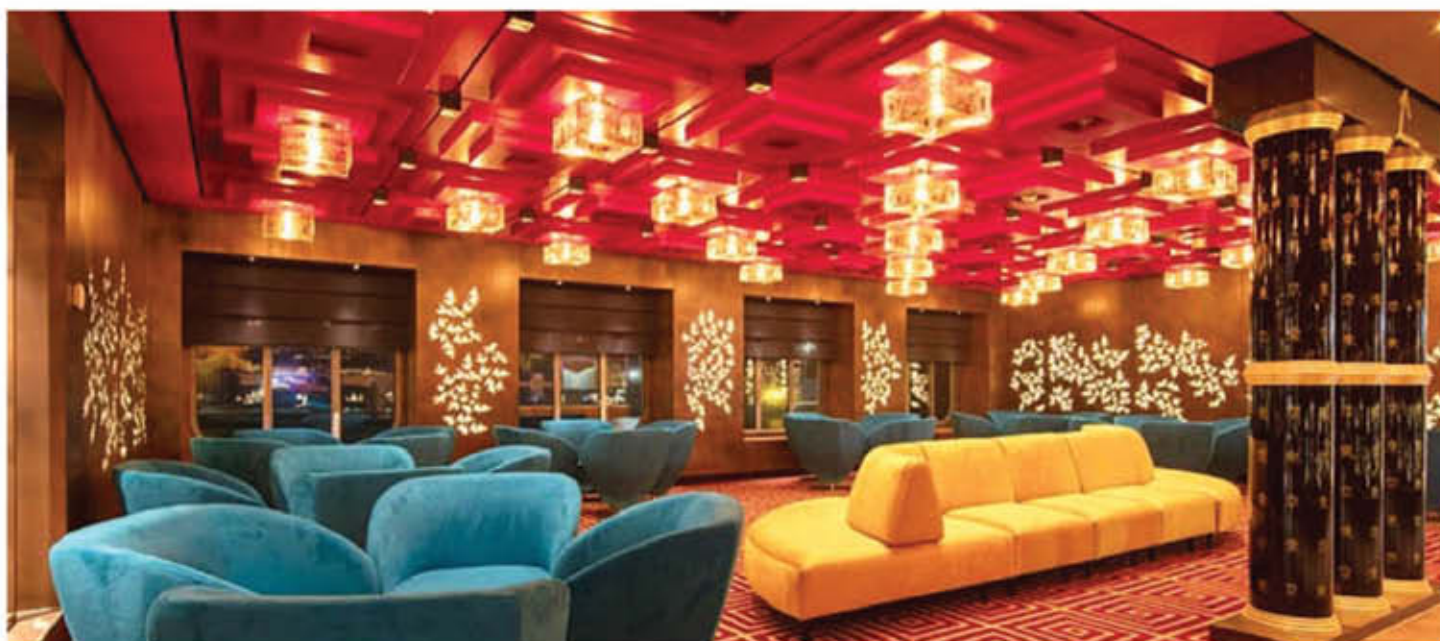
AIDA NOVA - ASIA BAR & LOUNGE