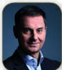
Harry Theocharis Minister of Tourism, Greece