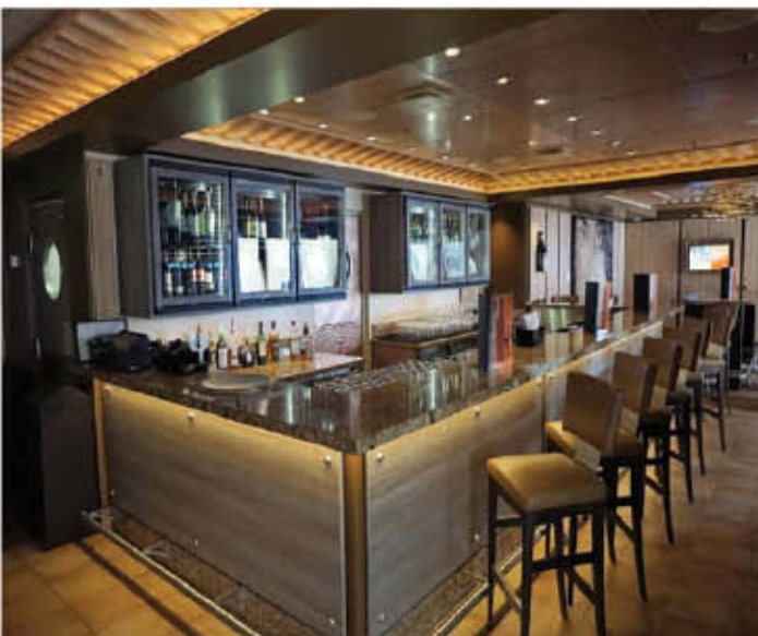
SYMPHONY OF THE SEAS - VINTAGES