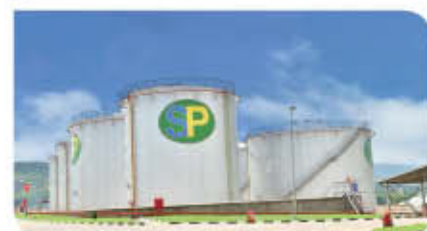
SP terminal - Rwanda

In April 2018 BB Energy entered into a strategic partnership with Grands Lacs Holdings Ltd, which is a group of oil marketing companies incorporated in Rwanda, Kenya and Tanzania. Amongst other, the group owns SP, the largest Oil Marketing Company in Rwanda with sourcing subsidiaries in Kenya and Tanzania.