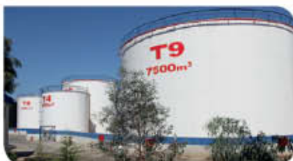
Antillas terminal - Lebanon

In Lebanon, our Group shareholders are the major importers of gasoline and diesel to private sector, and also own and operate two storage facilities with a combined capacity of 80,000m 3 .