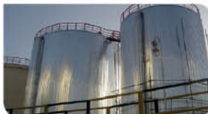
Maris terminal - Turkey

In Turkey, our Group shareholders own and operate a 12,500m 3 , state-of-the-art, storage facility in the port of Mersin which was specifically designed for the inland supply of hot bitumen to road contractors.