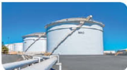
Pioneer Energy terminal - Australia

In March 2017, BB Energy completed the acquisition of Pioneer Energy Terminal in Mackay, Queensland from Morgan Stanley. Commissioned in 2015, Pioneer Energy is the largest diesel terminal in Mackay with storage capacity of 75,000 m 3 (3x25,000 m 3 storage tanks).