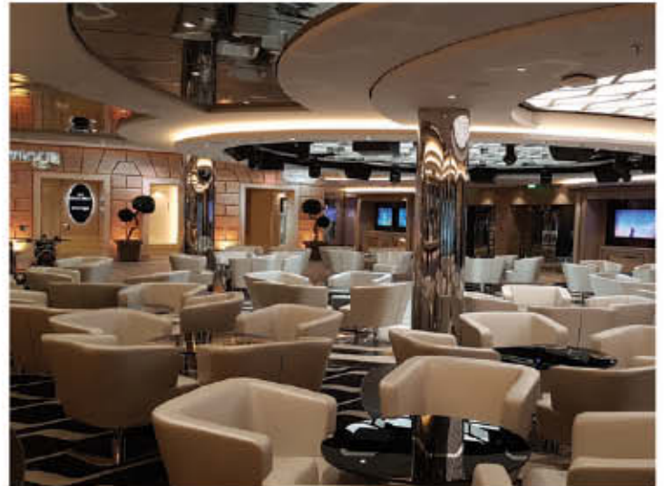
MSC MERAVIGLIA - PROMENADE KARAOKE