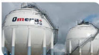
Omera terminal - Bangladesh

In 2013, BBE invested in Omera Petroleum Ltd, an LPG terminal and bottling facility in Bangladesh along with local partner, MJL Bangladesh Ltd and FMO, a Dutch development finance institution. BBE is the exclusive supplier of LPG to the facility with throughput capacity of up to 150,000 MT per annum. The main storage site is at the port of Mongla and includes a jetty, receiving terminal, two storage spheres with capacity of 3,600 MT, bottling/filling plant and distribution centre.