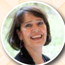
Ioulia Drossinou Head, Department of International Affairs Directorate of Agricultural Policy Documentation & International Affairs Ministry of Rural Development & Food Greece