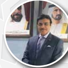
Sulaiman Hamid Almazroui Ambassador of the United Arab Emirates Greece