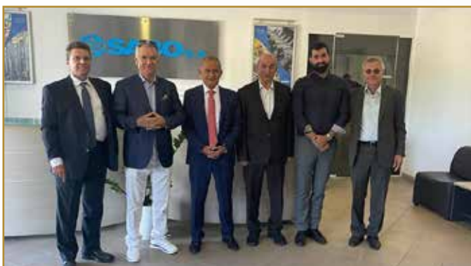
At SABO offices