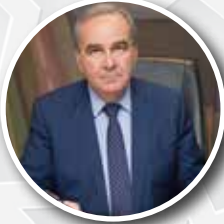
Nikos Papathanasis Alternate Minister for Development and Investment Greece