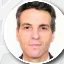
Mahieddine Djeffal Ambassador of the People's Democratic Republic of Algeria Greece