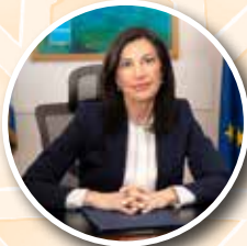
Olympia Anastasopoulou Secretary General for Tourism Policy & Development Ministry of Tourism Greece