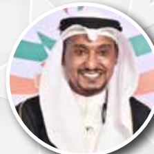
Mansour Saad Sulaiman Ahmad Alolaimi Ambassador of the State of Kuwait Greece