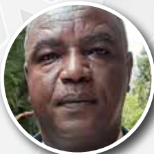
Ali Abu Elgasim Omar Dais Chargé d' Affaires Embassy of Republic of The Sudan Greece