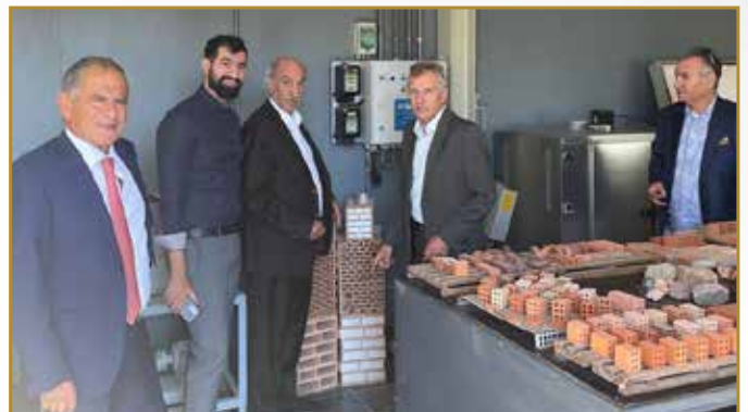
At SABO experiencing firsthand the quality of materials and products