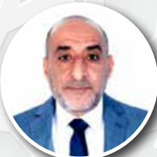
Hamad Bashir Al-Mabrouk Bousayf Ambassador of the State of Libya Greece