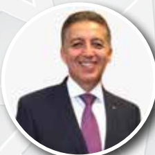
Omar Amer Youssef Ambassador of the Arab Republic of Egypt Greece