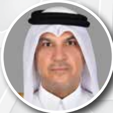
Waleed Bin Mohammed Al-Emadi Ambassador of the State of Qatar Greece