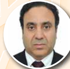
Hassane Alaoui Mostefi Minister Plenipotentiary Embassy of the Kingdom of Morocco in Greece