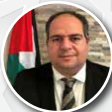
Yussef Dorkhom Chargé d' Affaires Embassy of the State of Palestine Greece