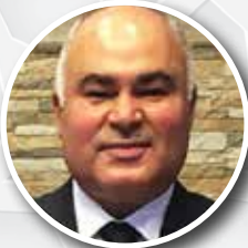
Mouayed Saleh Ambassador of the Republic of Iraq Greece