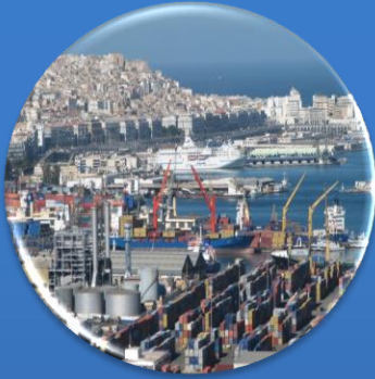
1. Maritime infrastructure