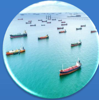
2. Maritime fleet