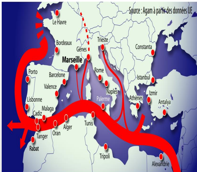
Répartition des flux maritimes